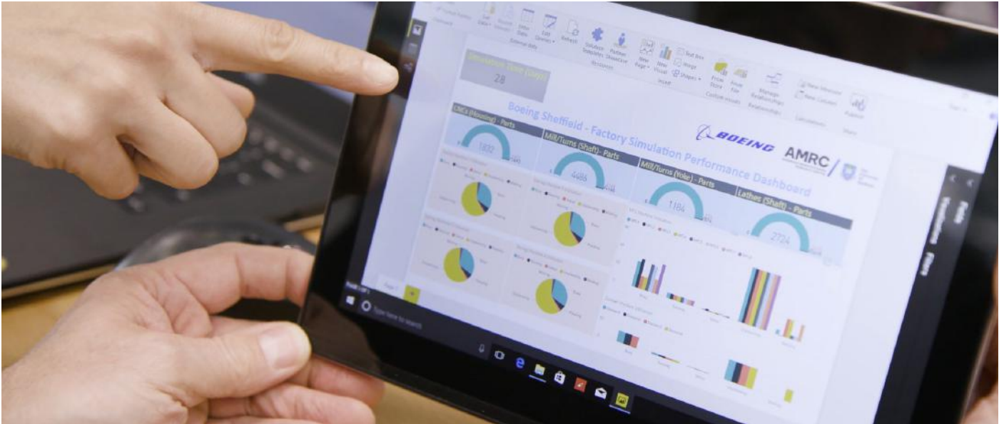
Dashboard system to monitor factory key performance indicators remotely.