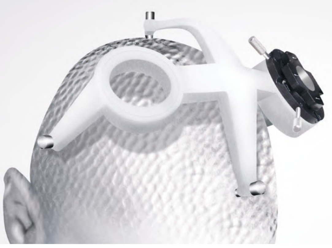
Patient and procedure customized Platform illustrating flexibility of form possible with SLS fabricated Platform.