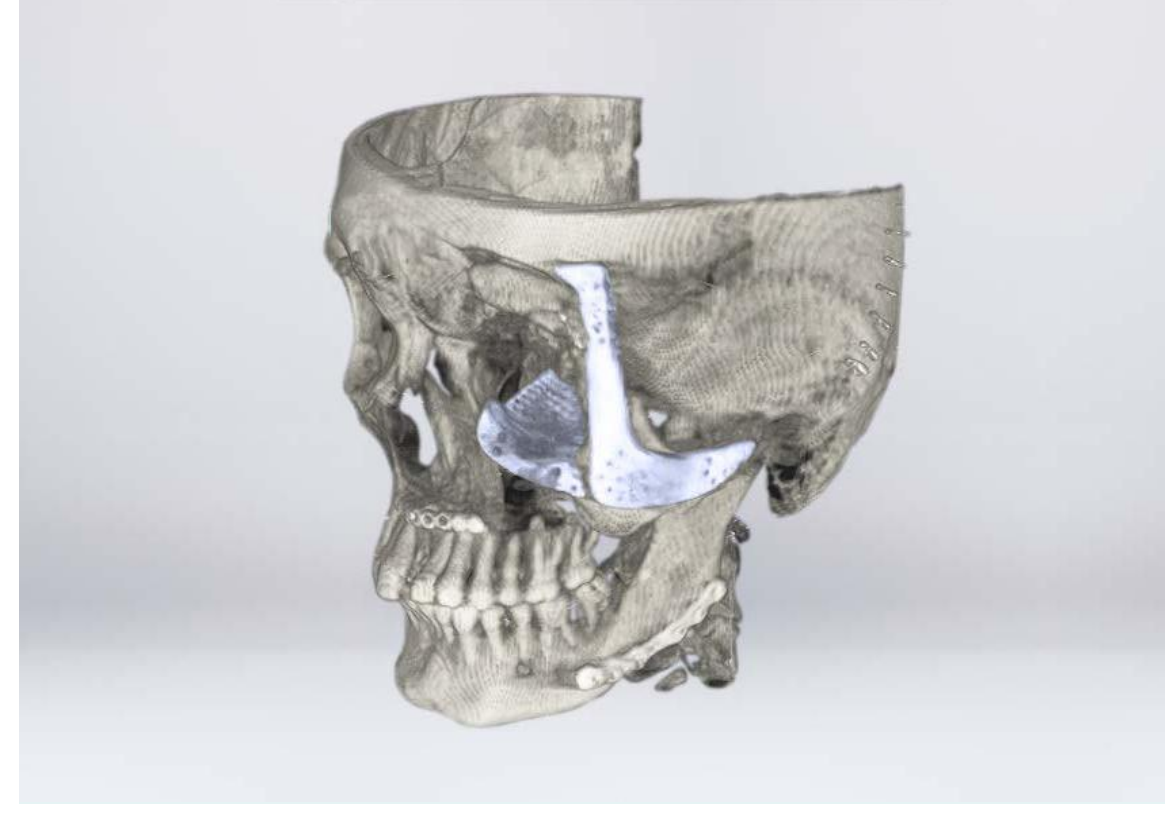
CT image of the zygomatic and orbital bone implant after surgery

EOS & CSIR-CSIO delivers customised implants for facial trauma patient